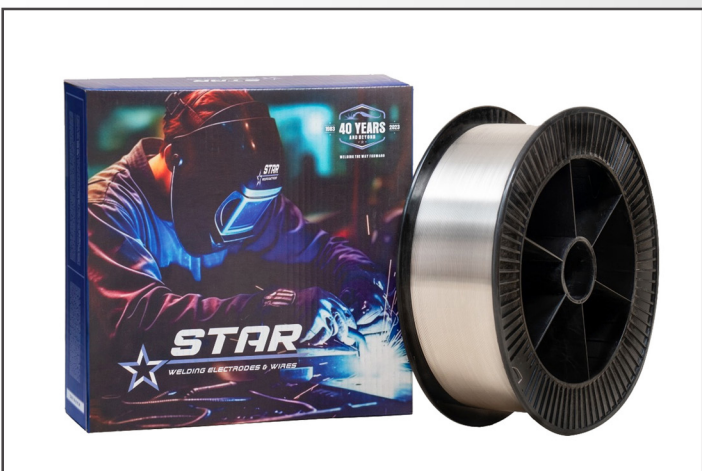
FLUX CORED WIRE