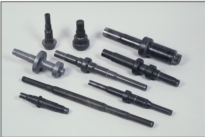
COLD FORGED PARTS