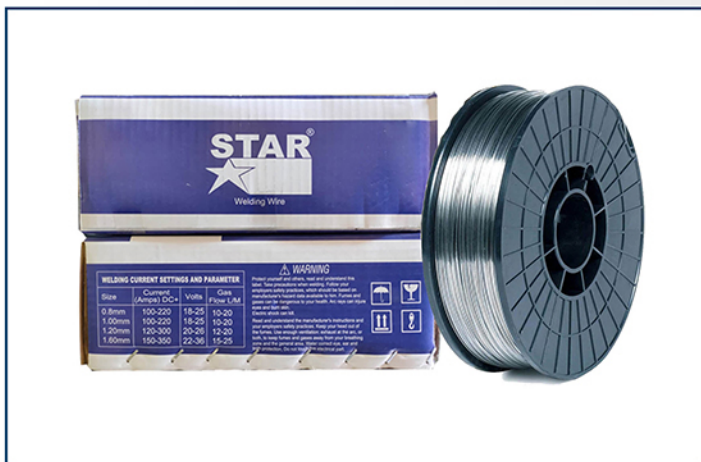
FLUX CORED WIRE