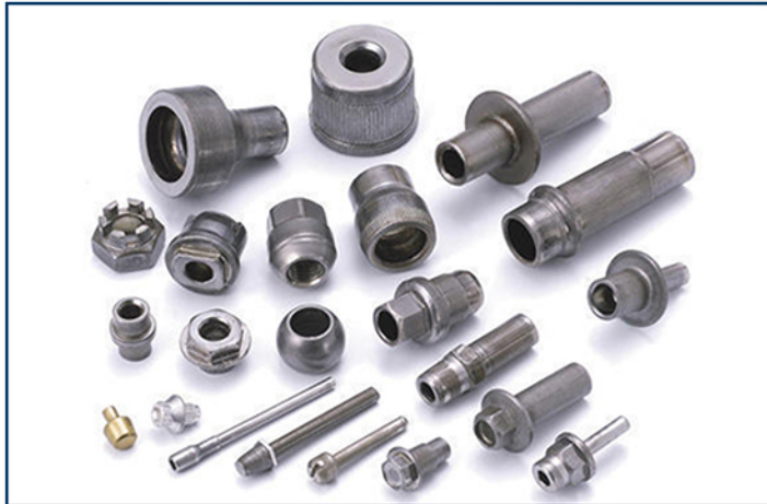
COLD FORGED PARTS